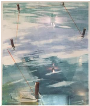
Channel #1 , 23.5 x 18 monoprint, framed