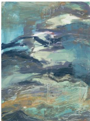
Flowing #8 , 24 x 18 acrylic on paper mounted on panel, unframed