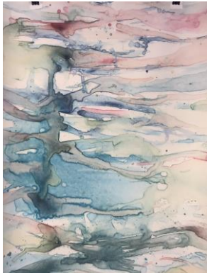
Currents #1 , 30 x 22, watercolor monotype, framed