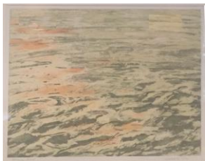
Morning Glow , 17.5 x 21.5, monoprint, framed