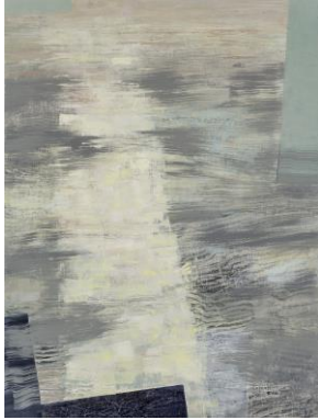
Softest of Mornings, Hello , 40 x 30, acrylic & oil on panel, unframed $4000