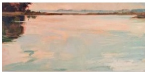
October Evening, Richmond Creek , 12 x 24, oil on panel, unframed