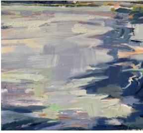
August Creek #1 , 13.5 x 15, oil on panel, framed