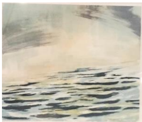
First Light , 17.5 x 21.5 monoprint, framed