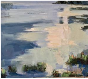
August Creek #2 , 13.5 x 15, oil on panel, framed