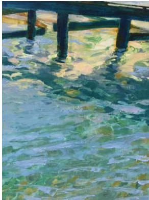
Early Morning, Under the Pier , 24 x 18, oil on panel, unframed