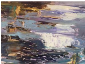
River Currents , 12 x 16, oil on panel, unframed