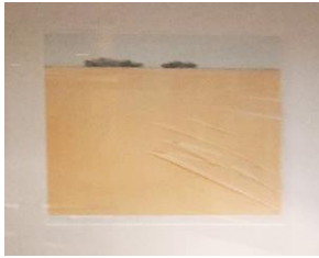
Spring Field #4 , 17 x 19 monotype, framed