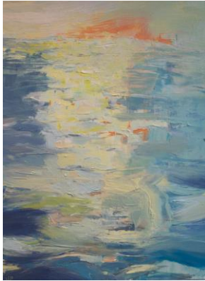
October Morning , 24 x 18, oil on paper, unframed $1500