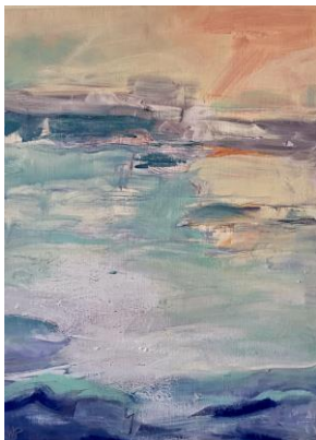
November Morning , 24 x 18, oil on panel, unframed $1500