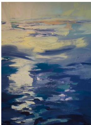
Flow #3 23.5 x 18, monotype, framed